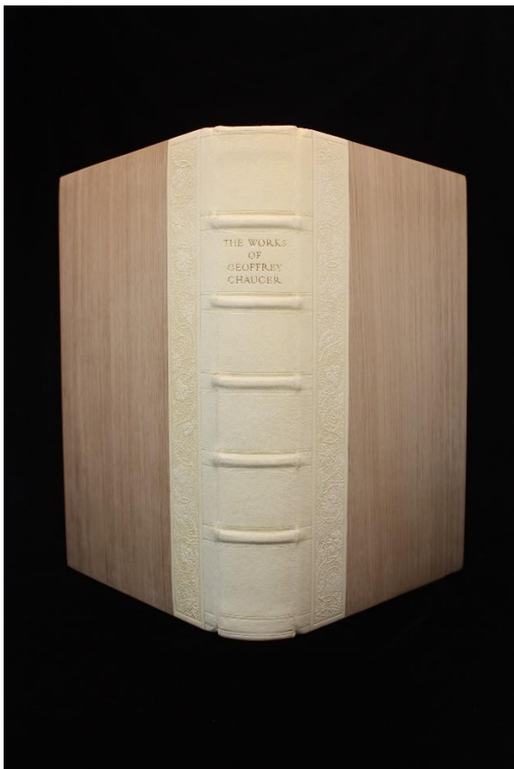
Finished book with the handmade quarter leather protective box