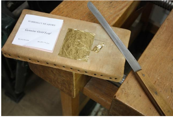
Gold leaf and finishing tools on the stove