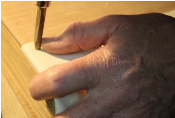
Blind tooling the lines and design